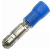
INSULATED BULLET TERMINALS MALE FEMALE