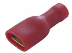
FULLY INSULATED SNAP ON TERMINAL (FEMALE)