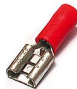
SEMI INSULATED SNAP ON TERMINAL (FEMALE)